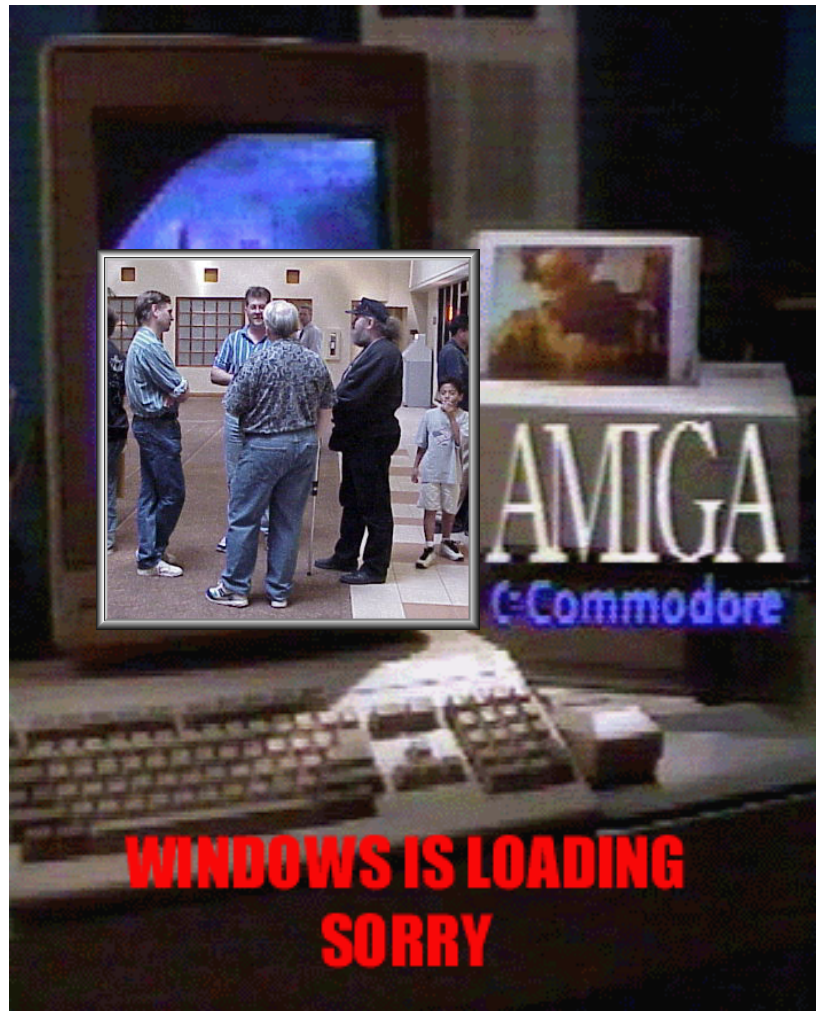
Amiga Computer Users of Edmonton